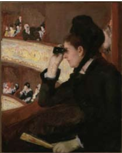
Mary Stevenson Cassatt, In the Loge (also known as Woman in Black At the Opera ), 1878, Oil on canvas, 81.28 x 66.04 cm (32 x 26 in.). The Museum of Fine Arts Boston, The Hayden Collection Charles Henry Hayden Fund, 1910.