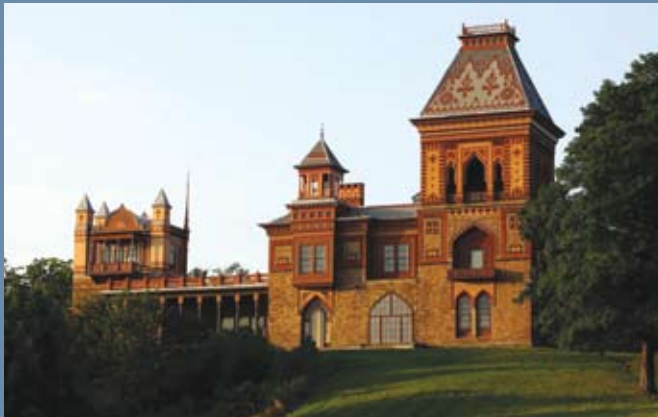
Olana created by Frederic Edwin Church (1826 -1900), a leading Hudson River School artist. The stone, brick, and polychrome stenciled Persian-style villa, shown above, is the best known element of Olana.

A charter bus will leave from The New York Historical Society at 170 Central Park West, New York at 10:00 AM. The day's activities include a picnic lunch on Olana's picturesque grounds, a house tour of Church's ornate, Persian-inspired villa, and a special exhibition preview. The new Evelyn & Maurice Sharp Gallery will feature a variety of F. E. Church's works representing Olana and environs. The bus will return to NYC at 6:00 P.M.