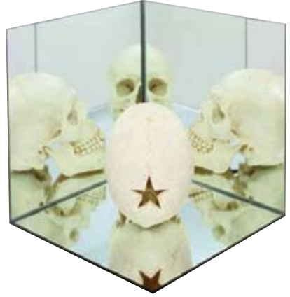
Douglas Gordon, Proposition for a Posthumous Portrait, 2004, skull, mirror, certificate of authenticity, variable dimensions, unique DG-23. reproduced in Inventing Marcel Duchamp: The Dynamics of Portraiture (ed. A. Goodyear and J.W. McManus, Smithsonian Institution and MIT Press, 2009), p. 293, plate 100.

Reception and Viewing of "Ray Johnson... Dali/Warhol/and others... 'Main Ray, Duchamp, Openheim, Pikabia...'" Richard L. Feigen & Co. 34 East 69th Street (between Park and Madison Avenues)