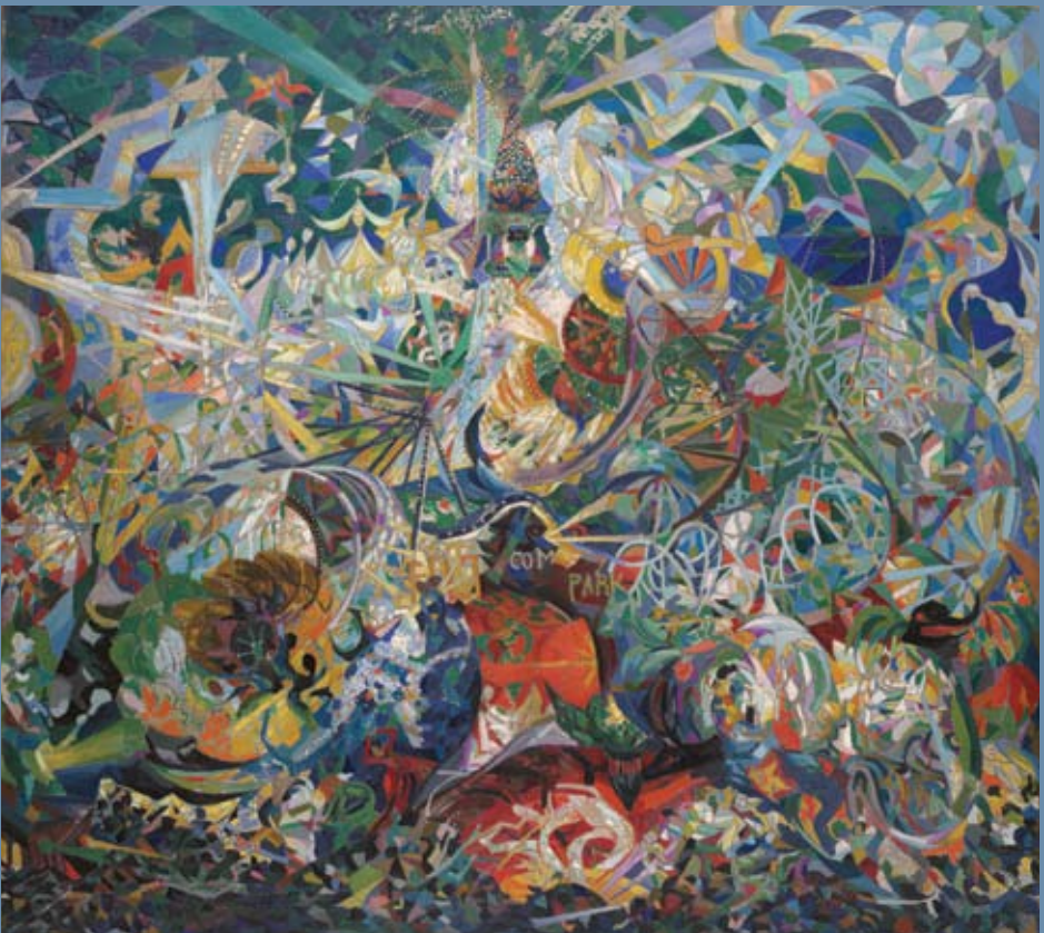
Joseph Stella, Battle of Lights, Coney Island, Mardi Gras , 1913–14, Oil on canvas, Dimensions: 195.6 x 215.3 cm (77 x 84 3/4 in.). Yale University Art Gallery, Gift of Collection Société Anonyme, 1941.689

This conference is dedicated to Harry L. Koenigsberg (1921–2002).