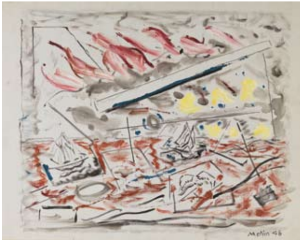
John Marin, Movement in Red , 1946, Oil on canvas, 25 x 32 inches; Courtesy Adelson Galleries.