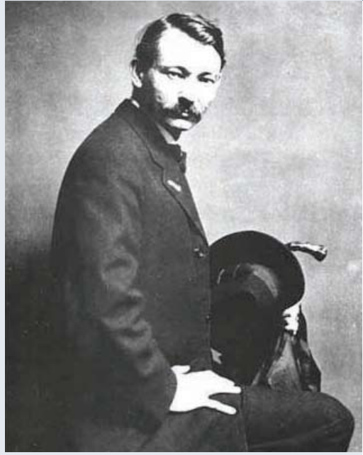
Gertrude Kasebier, Publicity Photograph of Robert Henri for The Eight Exhibition , 1907.