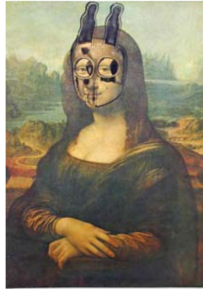
Ray Johnson, Untitled (Mona Lisa Bunny), 1984, Collage on cardboard with reproduction of Mona Lisa, 18" by 12.5".