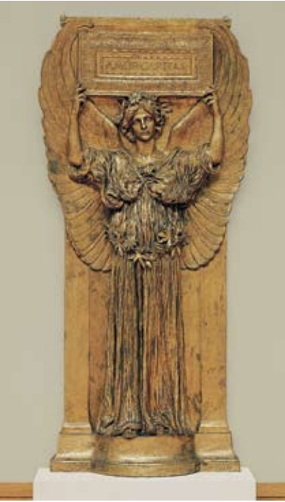
Augustus Saint-Gaudens, Amor Caritas , 1880-98; this cast, 1918, Bronze, gilt; 103 1/4 x 50 in. (260.3 x 127 cm). The Metropolitan Museum of Art, Rogers Fund, 1919 (19.124)

The day's formal sessions will take place at The New-York Historical Society at Central Park West and 77th Street.