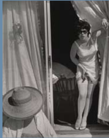
Cindy Sherman, Untitled Film Still #7 , 1978. Gelatin silver print, 9 1/2 x 7 9/16" (24.1 x 19.2 cm). The Museum of Modern Art, Acquired through the generosity of Sid R. Bass. © 2009 Cindy Sherman.