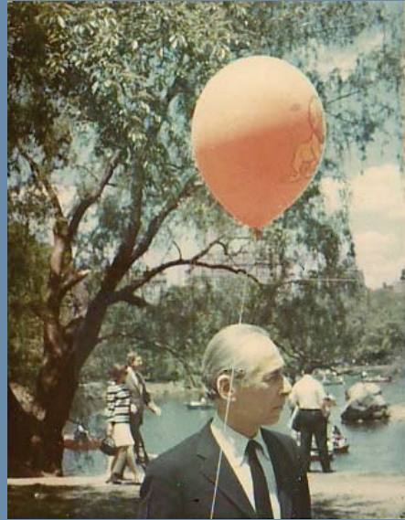
Portrait of Leo Castelli in Central Park, June 1967.