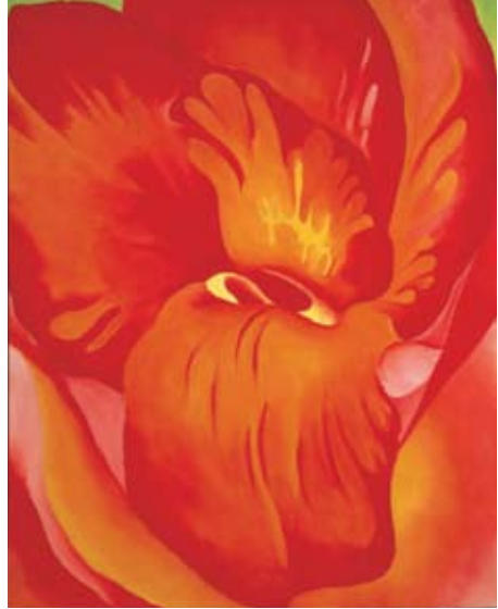
Georgia O'Keeffe, Canna Red and Orange , 1926, Oil on canvas, 20 x 16 in. (50.8 x 40.64 cm). Georgia O'Keeffe Museum, Gift of The Burnett Foundation (1997.06.39)