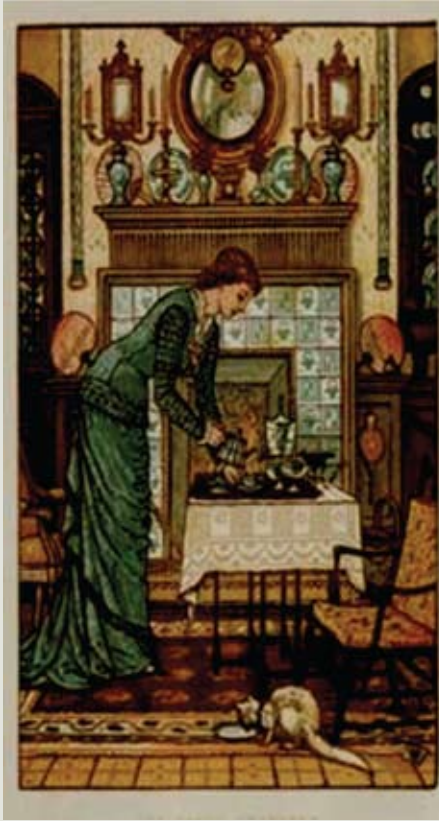
Walter Crane, "My Lady's Chamber." Frontispiece for Clarence Cook's The House Beautiful , Charles Scribner's Sons, 1881 ed.