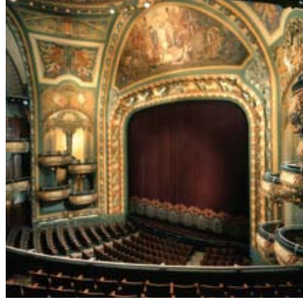
Herts & Tallant, Proscenium , New Amsterdam Theater, 1903.

Disney Theatrical Productions signed a 99-year lease for it in 1993. Restored to its original usage and grandeur, the theater was officially reopened in 1997.