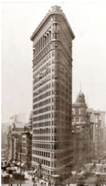
D. H. Burnham & Co., Flatiron Building, 1901 – 1903.