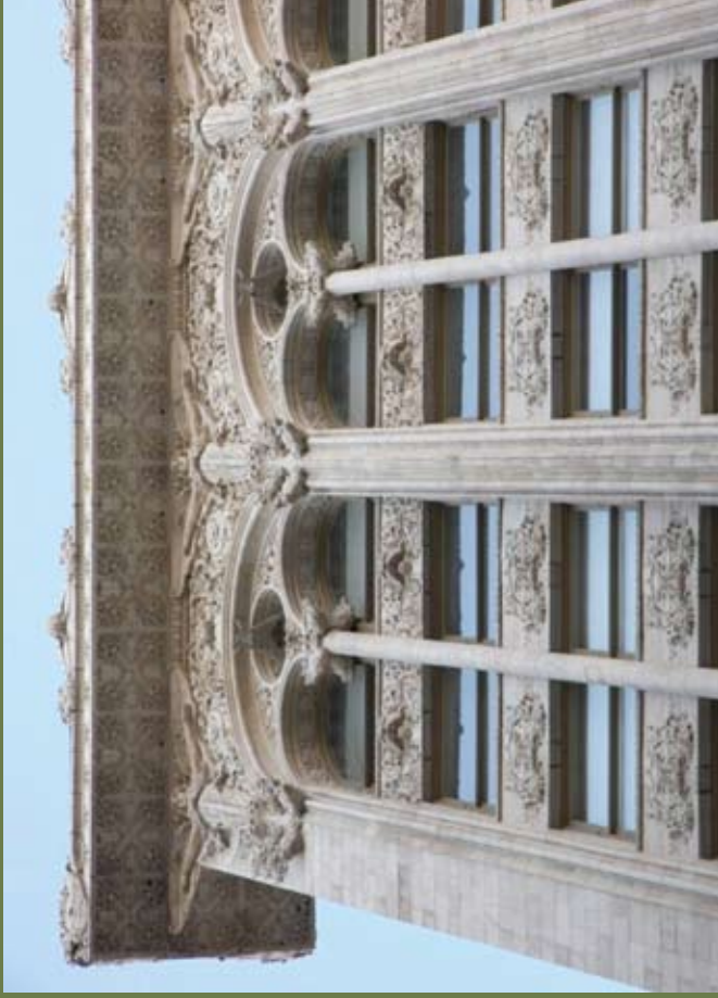
Louis Sullivan, Bayard Building , 1897 – 1899.

Initiatives in Art and Culture 333 East 57th Street, Suite 13B New York, New York 10022