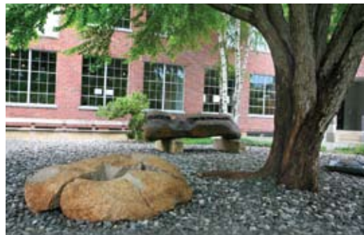
The Sculpture Garden, The Noguchi Museum.

Buses leave promptly at 8:00 p.m. for Manhattan.