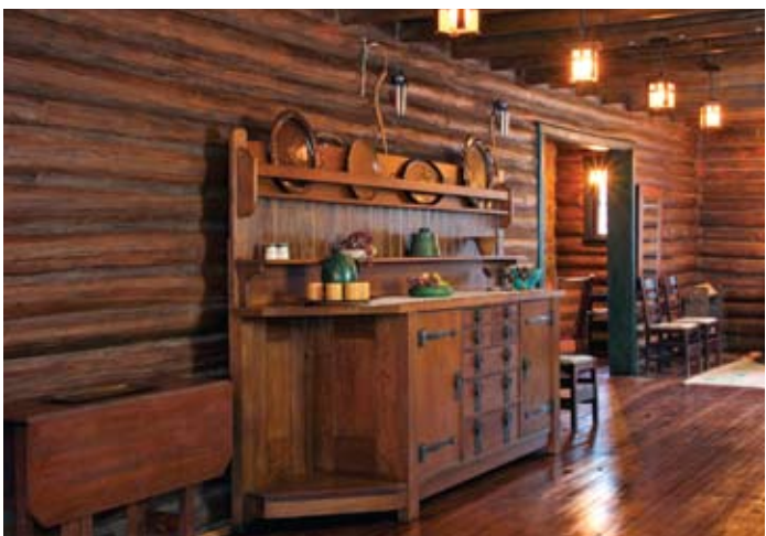
Gustav Stickley, Dining Room in The Log House, 1911 . The Stickley Museum at Craftsman Farms.

Buses depart at 4:30 p.m. to return to New York City.