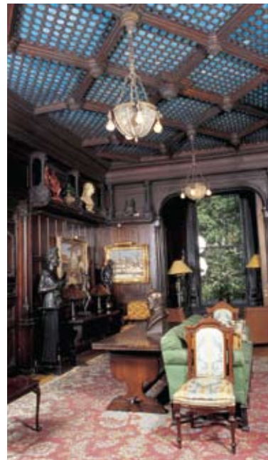
Vaux & Radford, Parlor , The National Arts Club, 1884 (formerly the Samuel Tilden House).

Built for Samuel Tilden, who won the popular vote for the 1876 presidential election, this building features an extraordinary Ruskinian exterior and breathtaking, well-preserved Aesthetic interiors. The National Arts Club is situated in Gramercy Park, which features a private park and a fine ensemble of late 19th and early 20th century architecture (including the Players Club, with alterations by McKim, Mead & White, 1888 - 1889).