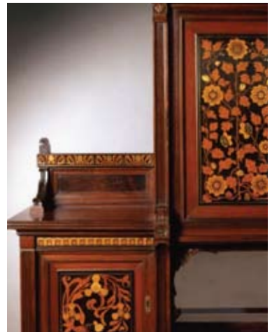
Pottier and Stymus, Lady's Secretary from the Mark Hopkins House, dated 1878, New York; primary wood: rosewood, secondary woods: mahogany and maple, with marquetry of other woods, brass and copper, original tooled leather writing surface, height 75.5 in, width 52.5 in, depth 19.5 in.