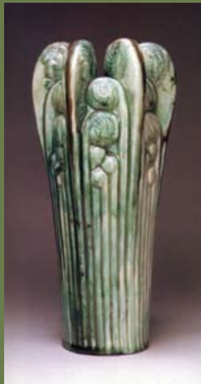
Tiffany Studios, Pottery Vase With Ferris c. 1905, height 12 in. New York, private collection.