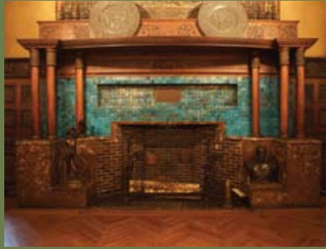
Louis Comfort Tiffany, Associated Artists, Mantelpiece from the Veterans Room at Park Avenue Armory, 1880 – 1881.