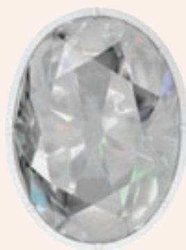
Representation of the Pigot diamond based on the drawing, ca 1820. By Philippe Liebart, Rundell's diamond setter and designer, who knew the stone well. He showed it in a simple silver display mount, as reproduced here. Three-dimensional reproduction: Jack Ogden.

Single-day registration options available; please send inquiries to: info@artinitiatives.com or call (646) 485-1952.