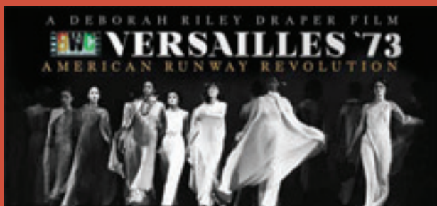
Poster for Versailles '73: American Runway Revolution , a Deborah Riley Draper Film, 2012.

THE GRADUATE CENTER, THE CITY UNIVERSITY OF NEW YORK