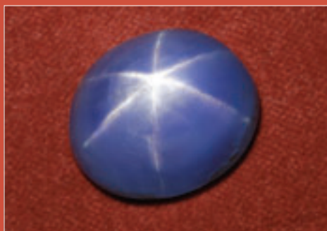
The Starry Night Sapphire, 111 cts. Burma. The heavenly blue color and the clarity of the star make the stone one of a kind.