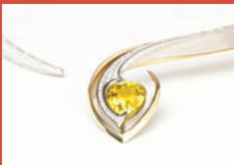
Eddie Sakamoto, Wicked , an 18-kt yellow-green gold and platinum collar-style necklace featuring a 30ct natural canary yellow, copper bearing tourmaline mined in Africa, and diamonds.

Somewhere In The Rainbow A Modern Gem & Jewelry Collection