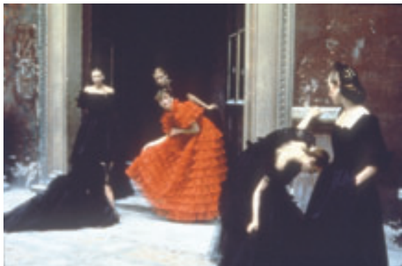
Deborah Turbeville, From the Valentino Collection, 1977.