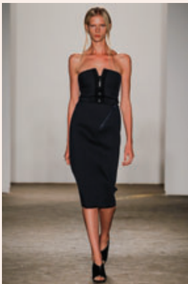
A look from Maria Cornejo's Spring 2013 runway show.