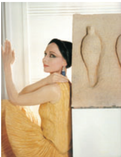
Mary McFadden at the Lannan Foundation in Palm Beach, Florida, wearing Carrier lapis lazuli earrings and a golden Mari pleated dress in Mary McFadden: A Lifetime of Design, Collecting, and Adventure (M. McFadden, New York: Rizzoli, 2012), p. 2.