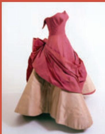
Charles James, Clower dress , pink silk taffeta, pale pink silk satin, 1953.