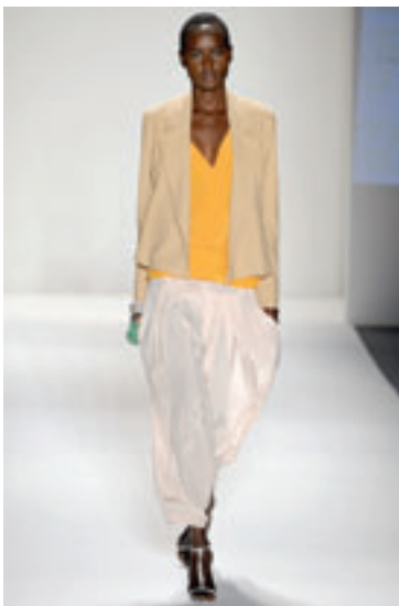
A look from Tracy Reese's Spring 2013 runway show.