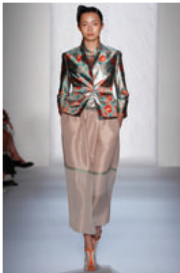
A look from Suno's Spring 2013 runway show.