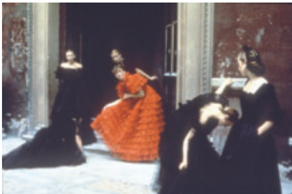
Deborah Turbeville, From the Valentino Collection, 1977.