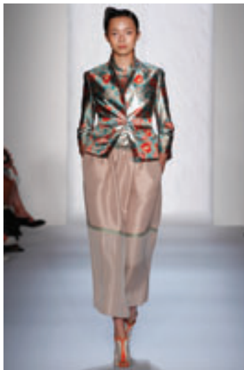
A look from Suno's Spring 2013 runway show.