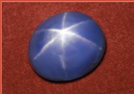
The Starry Night Sapphire, 111 cts. Burma. The heavenly blue color and the clarity of the star make the stone one of a kind.