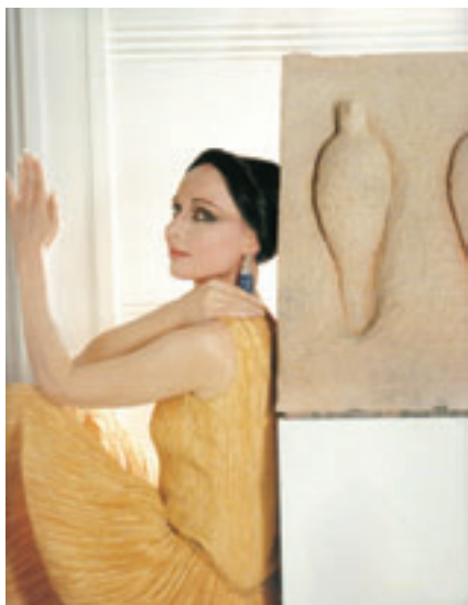
Mary McFadden at the Lannan Foundation in Palm Beach, Florida, wearing Carrier lapis lazuli earrings and a golden Mari pleated dress in Mary McFadden: A Lifetime of Design, Collecting, and Adventure (M. McFadden, New York: Rizzoli, 2012), p. 2.