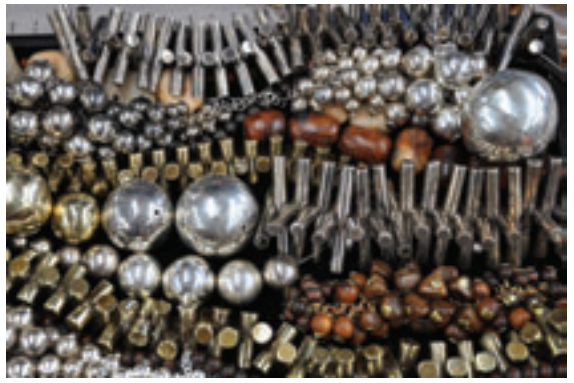
Robert Lee Morris, Iconic Robert Lee Morris forms layered for Donna Karan's Fall 2007 runway show.